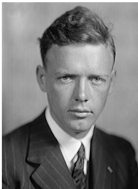
Charles Augustus Lindbergh